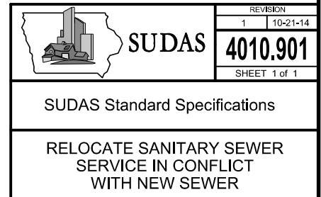
FIGURE 4010.901 SHEET 1 OF 1