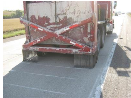
Crack and Seat - Photo courtesy of Antigo Construction

In urban areas, a full depth saw cut along the curblines and also around manholes and utility fixtures, such as water valves, is required prior to conducting crack and seat operations. In addition, a guillotine style breaker should be used with caution where structures are near the roadway. Impacts from the large single breaker can vibrate structures and cause concerns for property and utility owners. A segmental breaker results in lower magnitude vibrations and is recommended for crack and seat projects in urban areas. Informing the public about the project and especially the project schedule will help avoid potential problems. Assuring complete transverse cracking is critical with a segmental breaker. The breaking pattern with the segmental breaker must be varied to avoid developing continuous longitudinal cracks. Crack and seat activities typically produce earth-borne vibrations that are below the level necessary to cause damage, unless the source of the vibrations is very close (< 25 feet). Therefore, these lower intensity vibrations can be considered annoying and may cause people to believe that the building is being damaged, when in reality it is not being damaged. However, there are certain conditions such as close proximity to historical buildings or buildings that house historical or antique